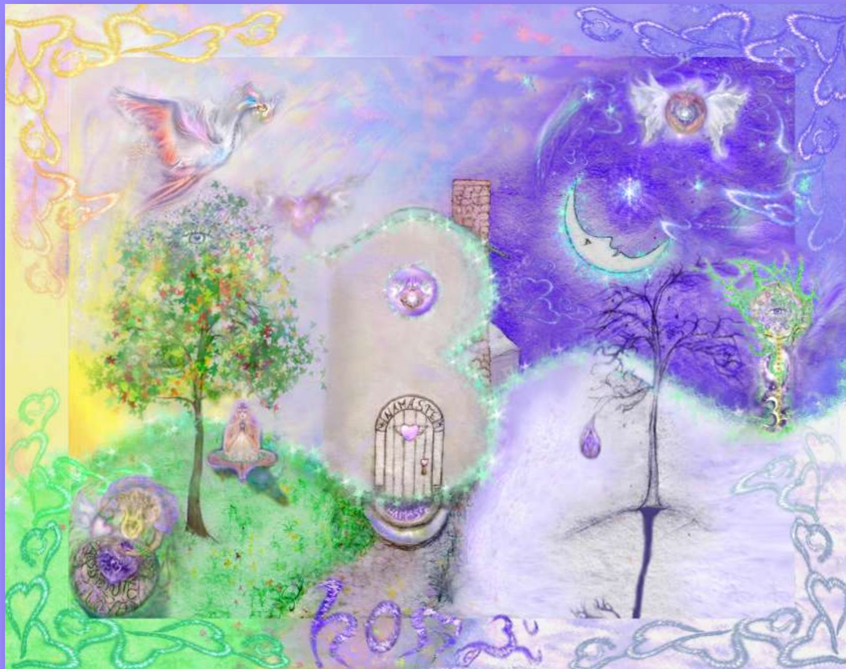
The I-Candeesse at ॐ Sweet hOMB~